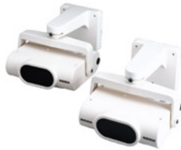
Beam Type Smoke Detector

Infrared detectors operate by “looking” for the varying light intensities of fire. Detector operation can be affected by sunlight and reflections. If the problem is identified as a reflection, remove the condition creating the reflection. If the condition is related to sunlight, have facility maintenance personnel shade the unit to remove the light condition. Care should be taken not to obstruct the area, process or tank being protected by either of these devices and the units should be inspected and tested to ensure they are in proper working order as soon as possible.